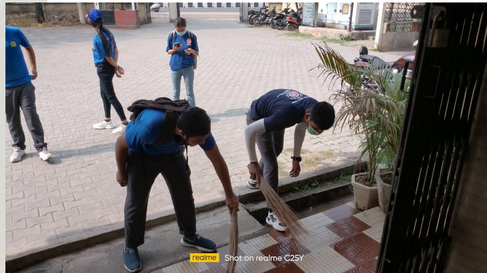
Campus cleaning by the students