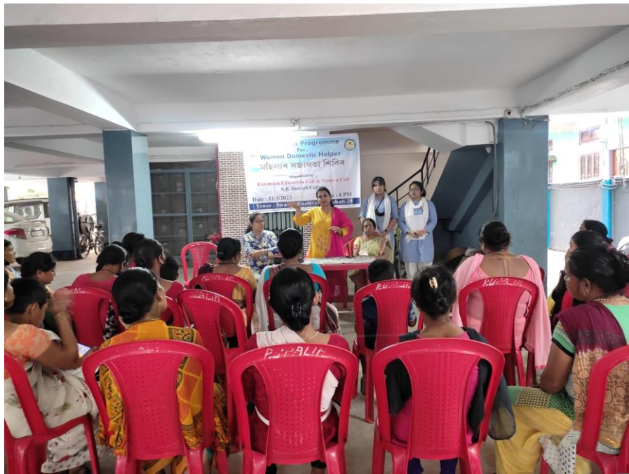
Donation of cloth and awareness programme by Extension Education Cell