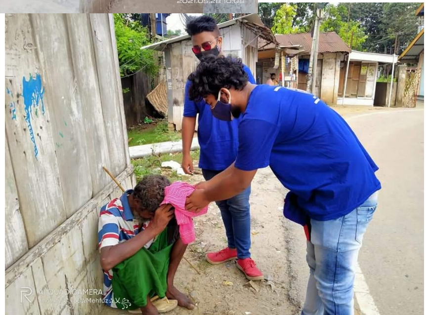
Distribution of foods, cloths and masks during covid period by the NSS volunteers of the college