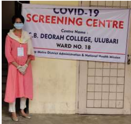
Covered in Prag News Channel on 08/07/2020: https://www.youtube.com/watch?v=g6rhdzFVpS0