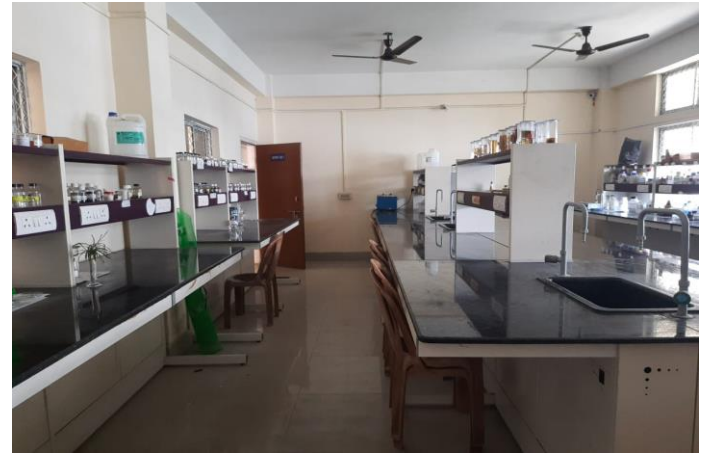
Laboratory of Department of Botany