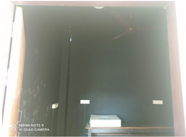
Dark Room for Experiments in Optics