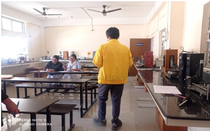
Laboratory of Department of Physics