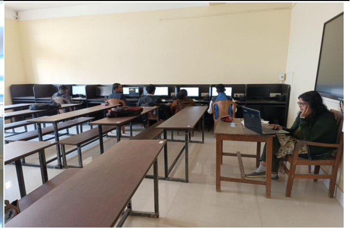
Computer Lab. Of Department of Mathematics