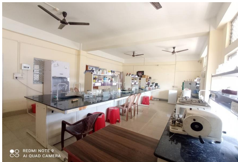
Laboratory of Department of Zoology