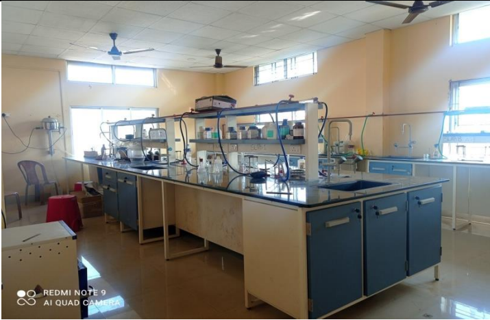
Laboratory of Department of Chemistry