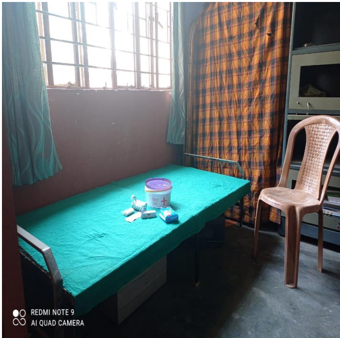
Sick bed with First Aid Kit