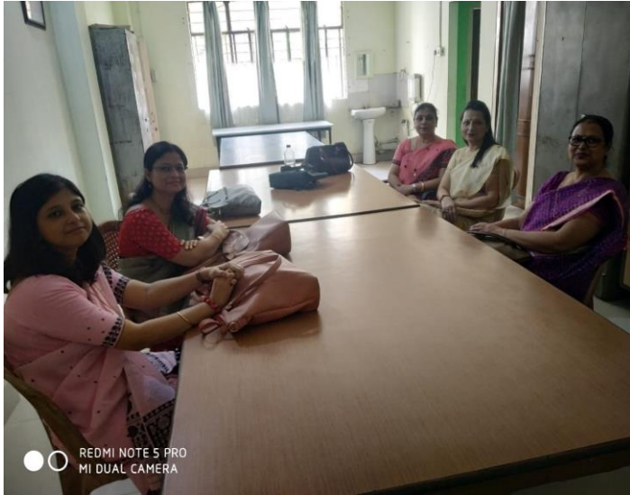
Common room for conduction of staff meetings