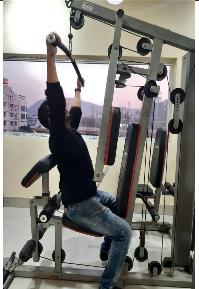
Gymnasium for the staff to maintain physical fitness