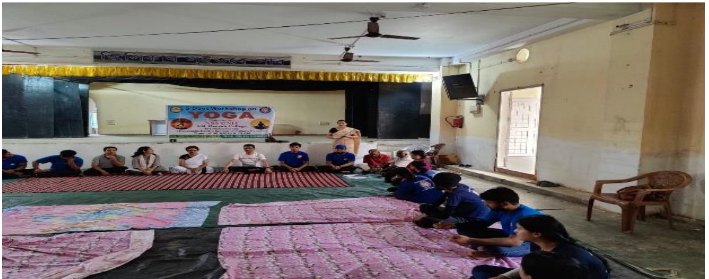
Yoga, Meditation and Health camps