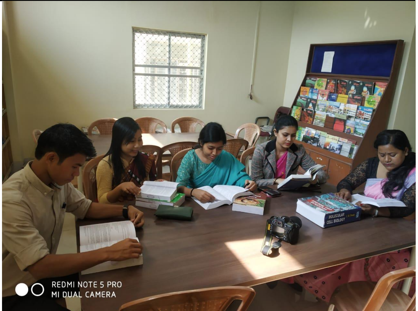
Reading space in the library for the teaching staff