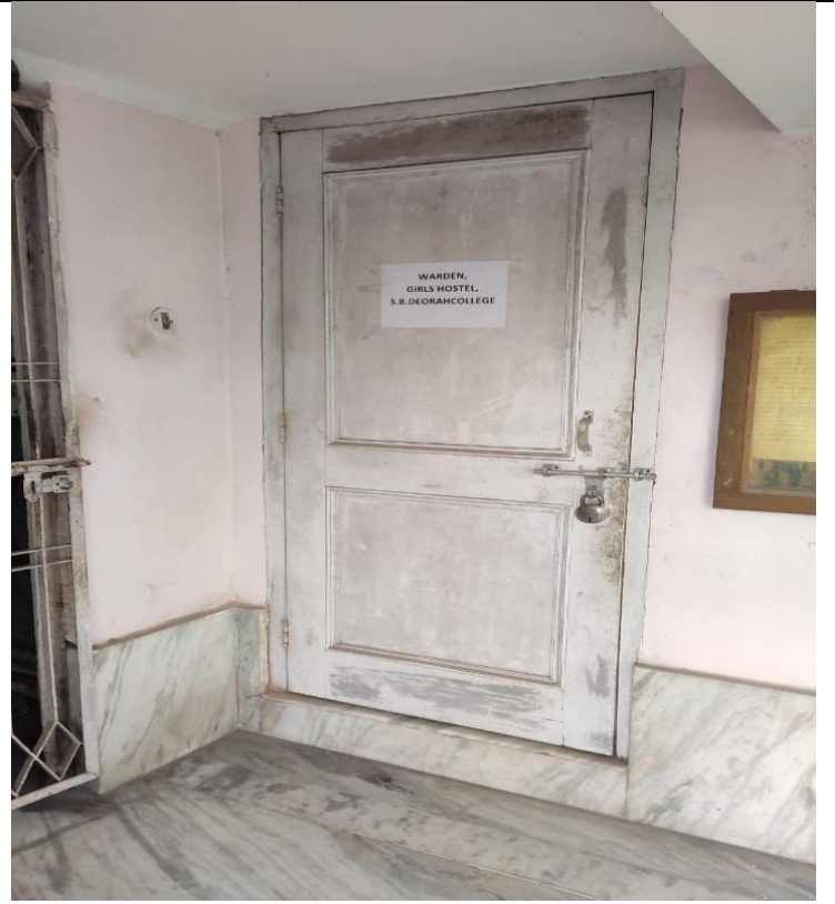
Residential quarter of hostel warden