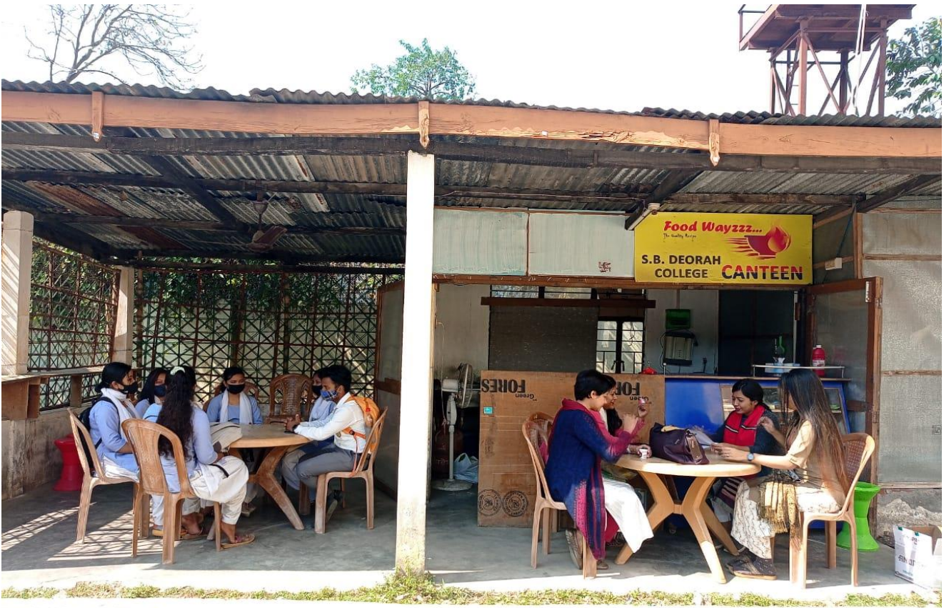
College Canteen, S. B. Deorah College, Guwahati-07