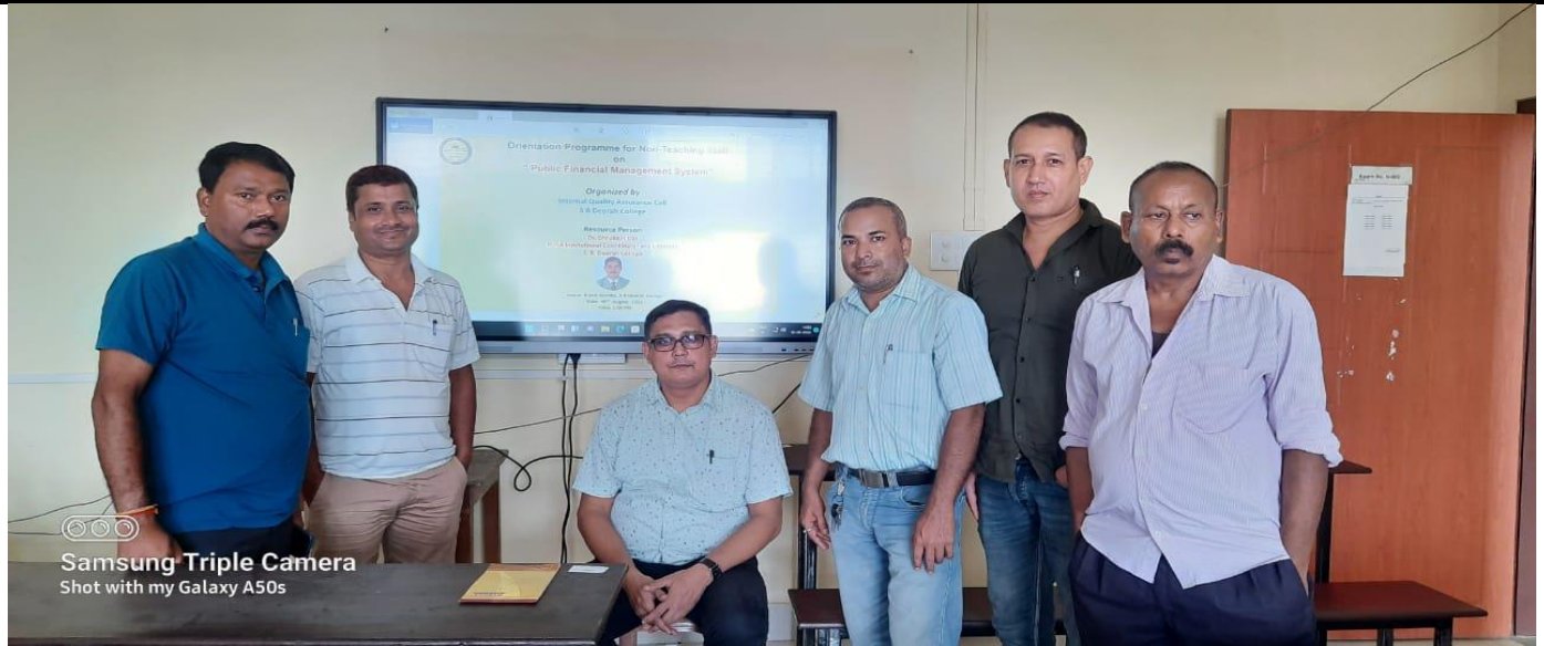
Training programmes for non-teaching staffs